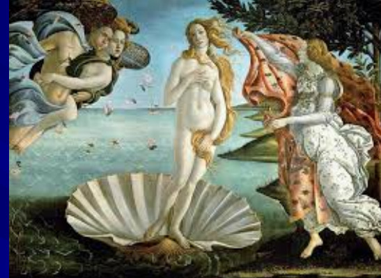
The Birth of Venus