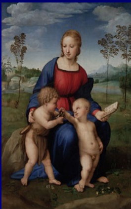
Madonna of Goldfinch