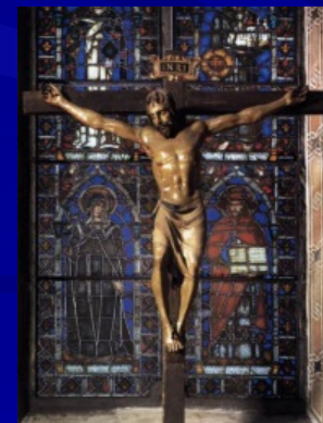
Crucifix by Donatello