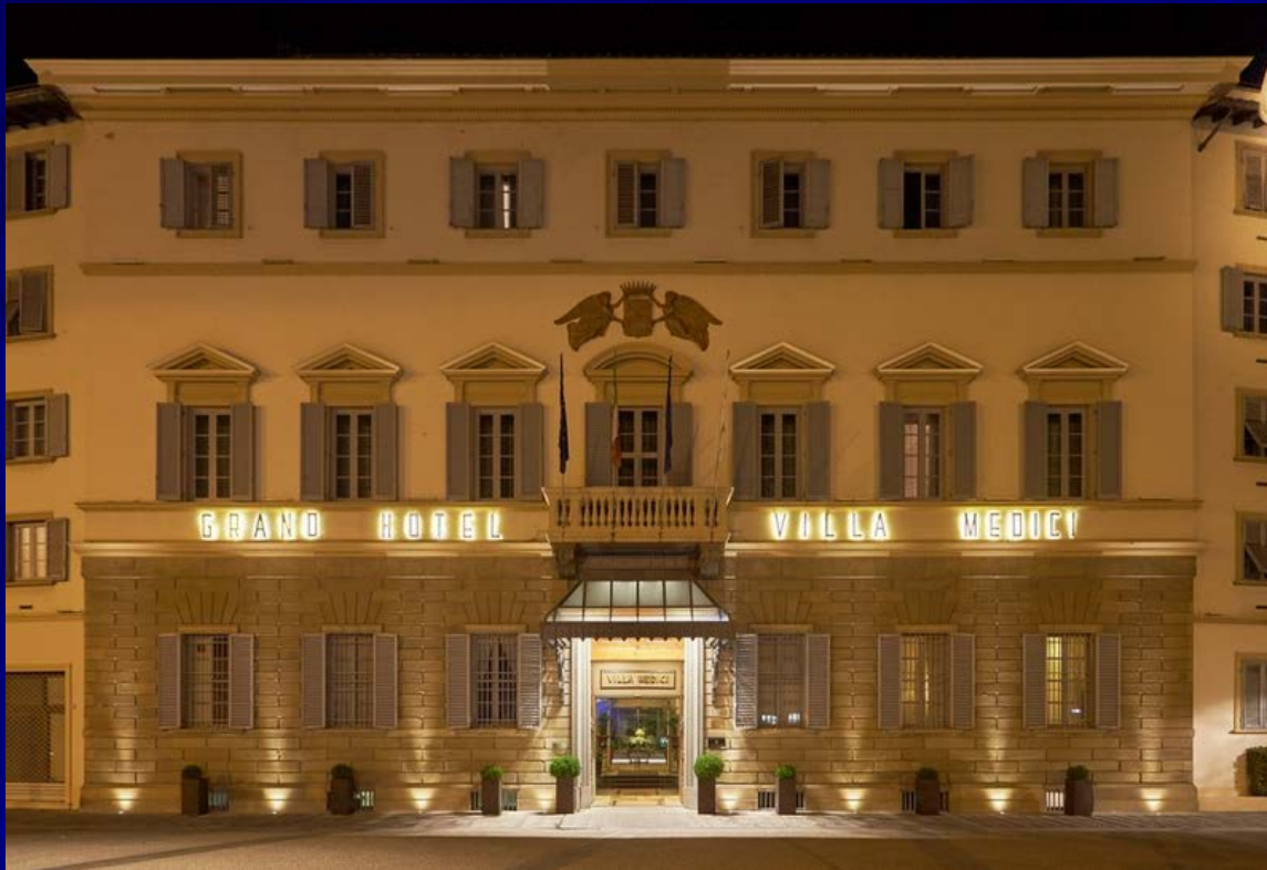
Sina Villa Medici Hotel