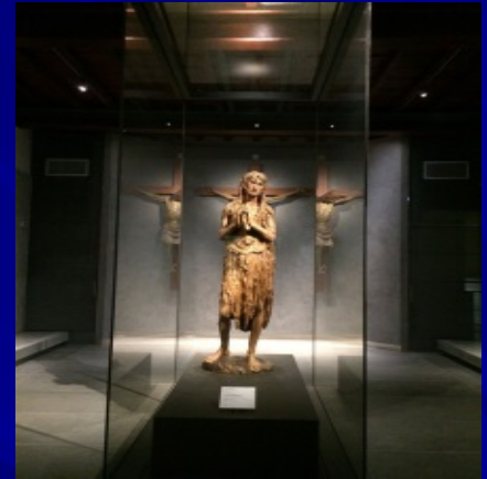
Donatello's Penitent Saint Mary Magdalene