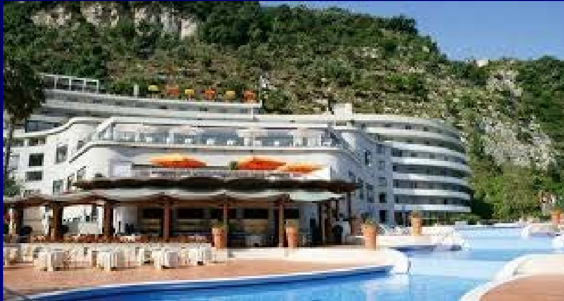
Hilton Sorrento Palace