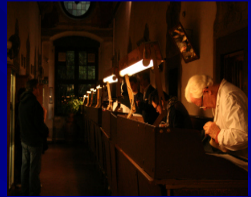
Scuola del Cuoio