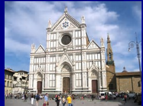
Santa Croce Basilica

The afternoon begins with a guided tour of Santa Croce Basilica, which is one of Florence's largest churches and the largest Franciscan church in the world. Construction began in 1294 by architect, Arnolfo di Cambio, but was not completed until 1442. It is considered a masterpiece of Gothic art. The basilica has over 16 chapels and contains numerous examples of typical Renaissance sculpture, with the most famous – the Crucifix by Donatello – dating back to 1425. The presence of approximately 276 funeral monuments and tombstones has led to Santa Croce being thought of as the burial place of Florence's most illustrious citizens. Famous persons buried there include Michelangelo, Machiavelli, Rossini and Galileo.